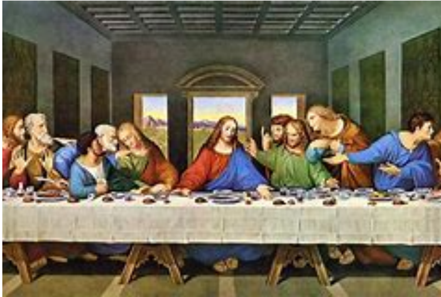
Famous Painting of Last Supper