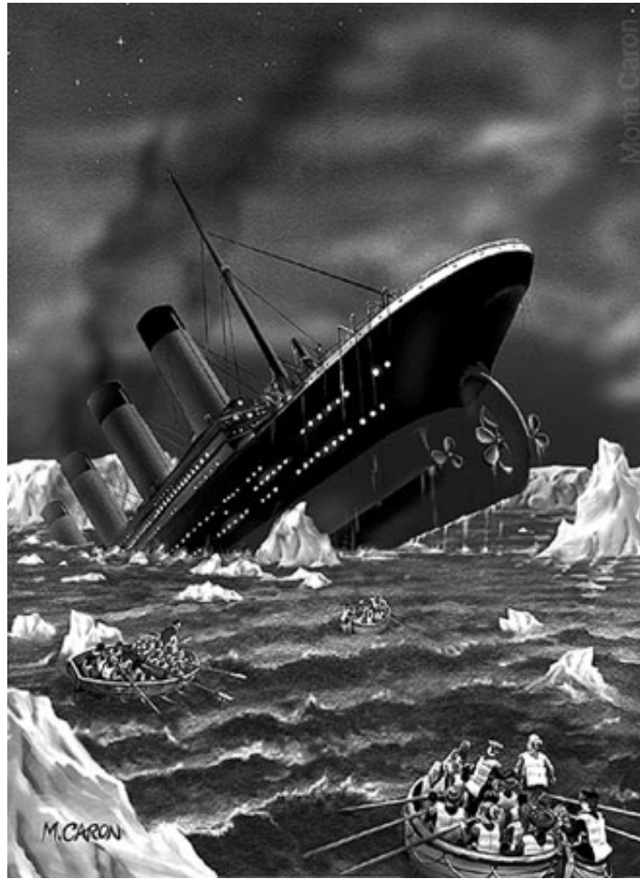
Painting/artist's rendering based on actual survivors.

“Living under the rule and reign of God is the best life possible!”